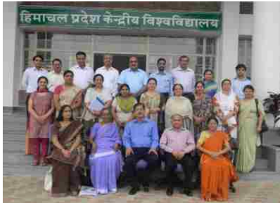
Resource Persons from NUPEA and CUHP