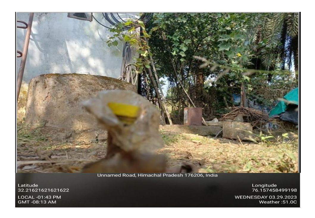
Biogas Plant at Shahpur facility is available at Central University of Himachal Pradesh, Shahpur Campus.