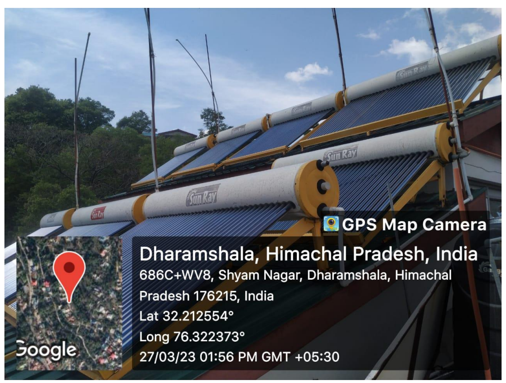
Solar Energy Panels at Girls Hostel roof