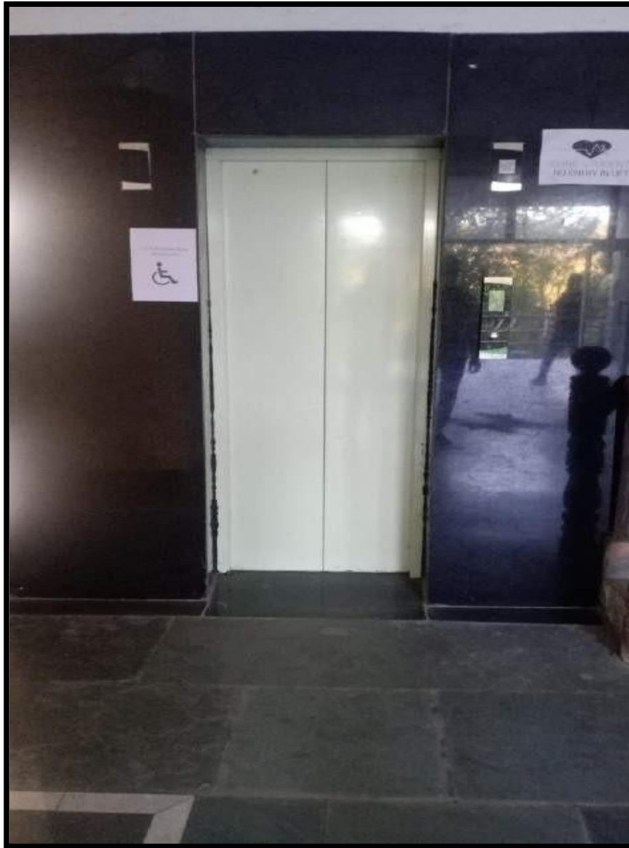
Photograph showing the facility of Lift for easy access to Divyangjan classrooms at Dehra Campus