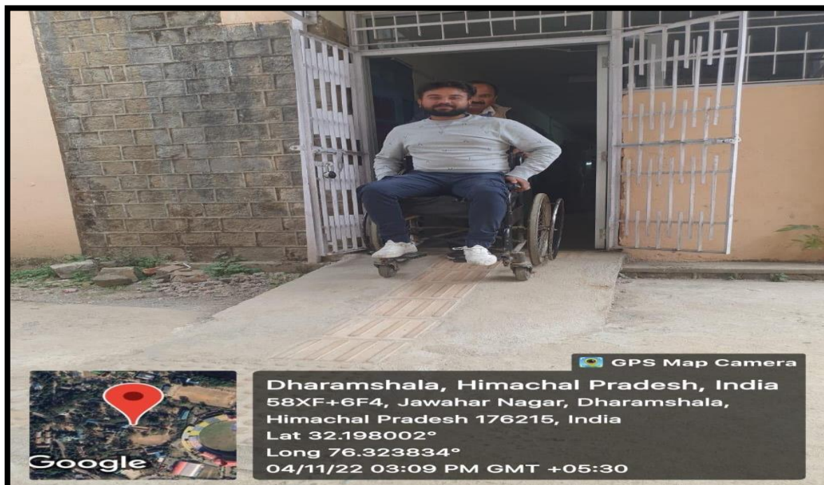
WHEEL CHAIR AND TACTILE PATH

Photograph showing the facility of tactile path to create Divyangjan friendly environment at Central University of Himachal Pradesh