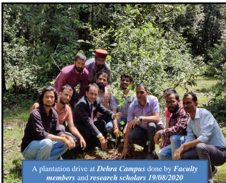
A plantation drive at Dehra Campus done by Faculty members and research scholars 19/08/2020