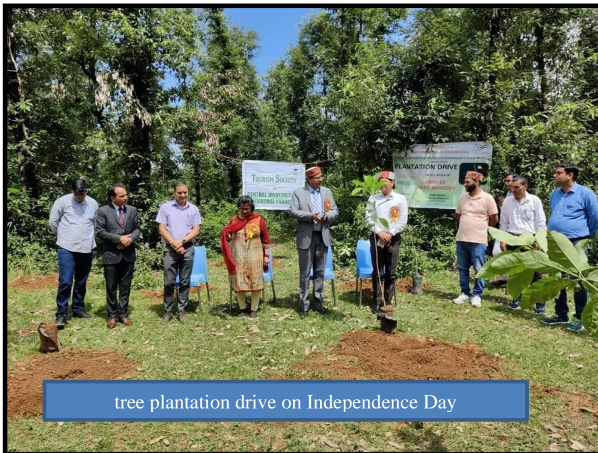
tree plantation drive on Independence Day