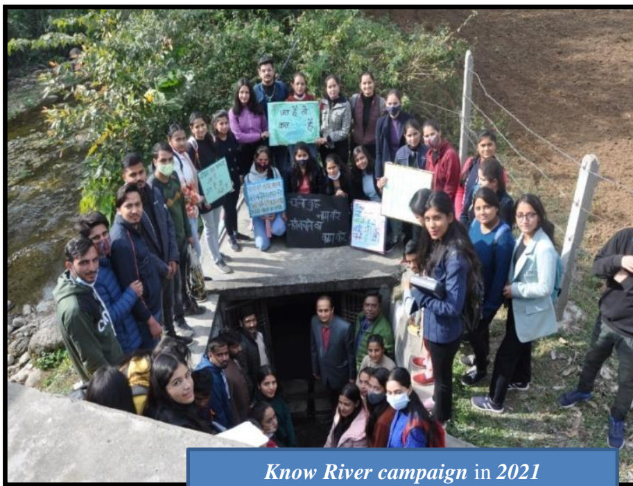
Know River campaign in 2021