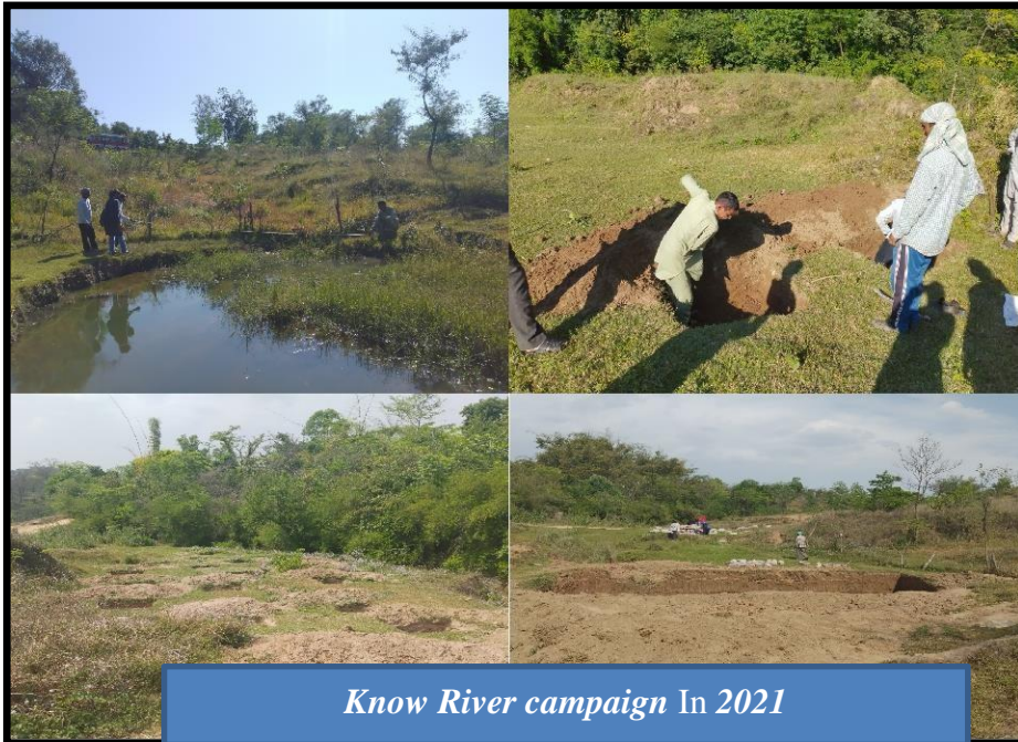
Know River campaign In 2021