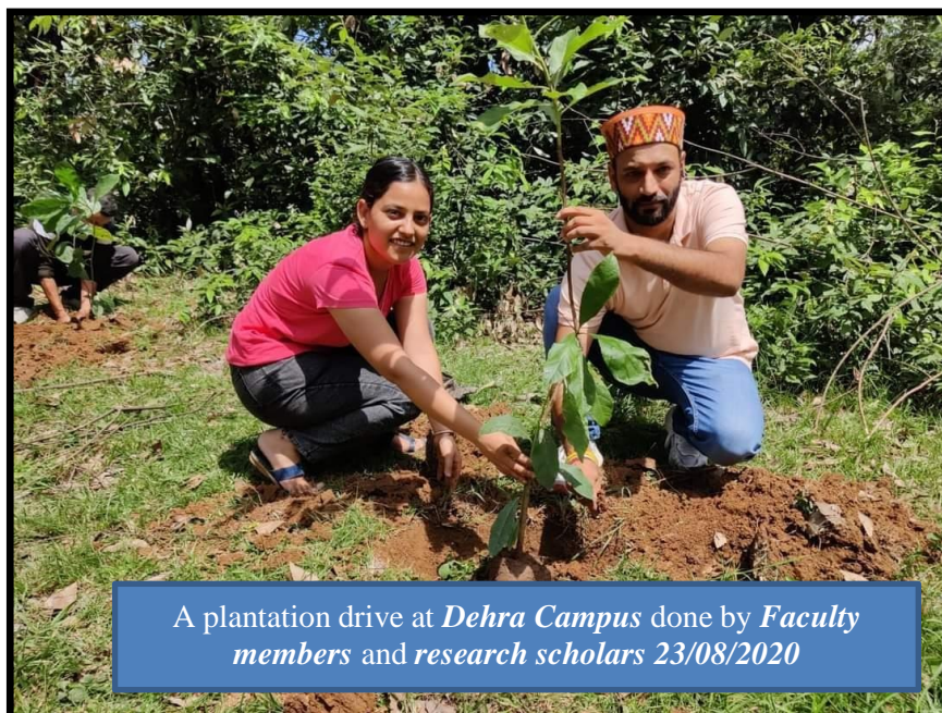
A plantation drive at Dehra Campus done by Faculty members and research scholars 23/08/2020