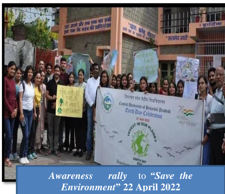
Awareness rally to “Save the Environment” 22 April 2022