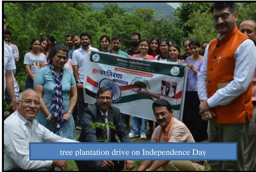
tree plantation drive on Independence Day