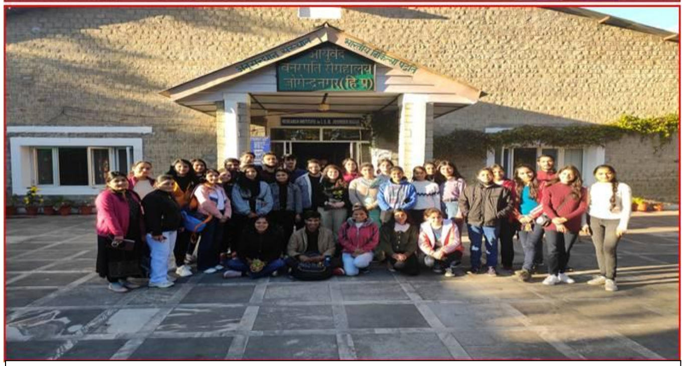
Educational Tour of the Department of Plant Sciences