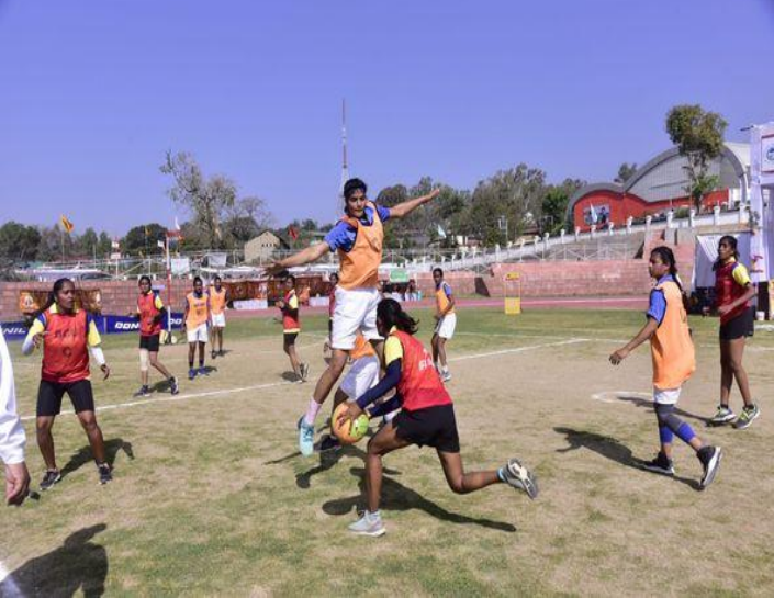
राष्ट्रीय महिला नेटबॉल प्रतियोगिता में भाग लेते खिलाडी।