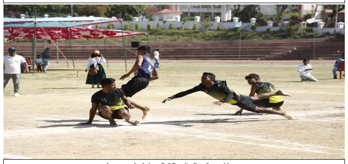
जोनल पुरुष खो-खो खेल प्रतियोगिता में प्रतिभागी भाग लेते हुए |