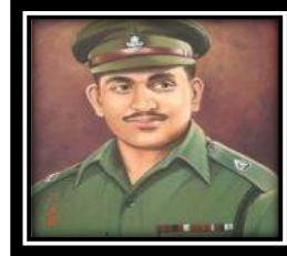
Major Som Nath Sharma