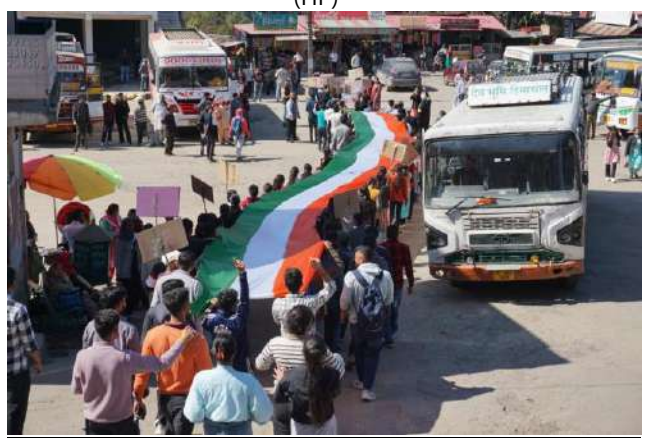
Tiranga Rally by volunteers at Dehra