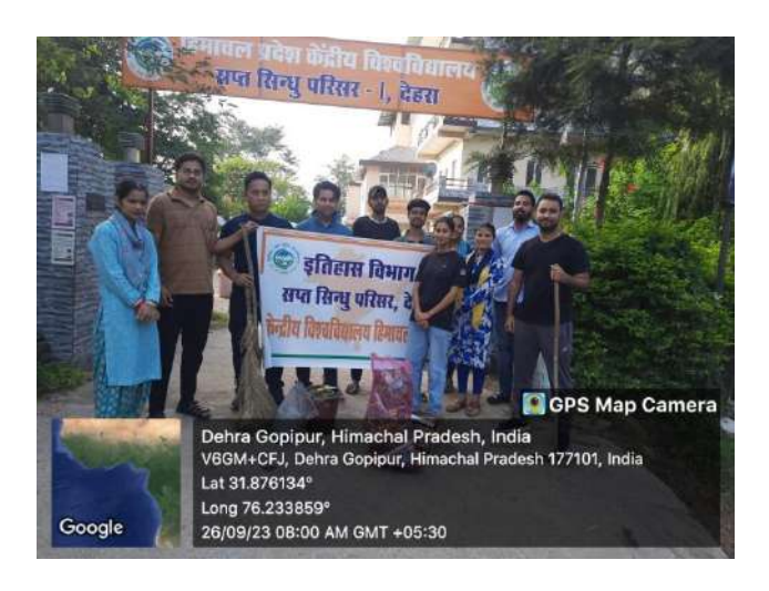
Cleanliness Drive by Department of History