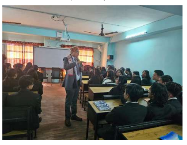
Hon'ble Vice-Chancellor interacts with the students of Gandaki University, Nepal