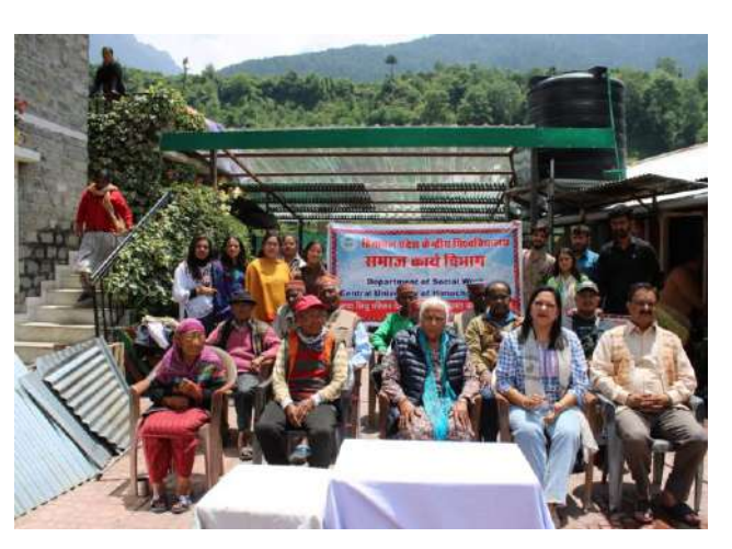
Visit by Department of Social Work at Old Age Home, Mandi