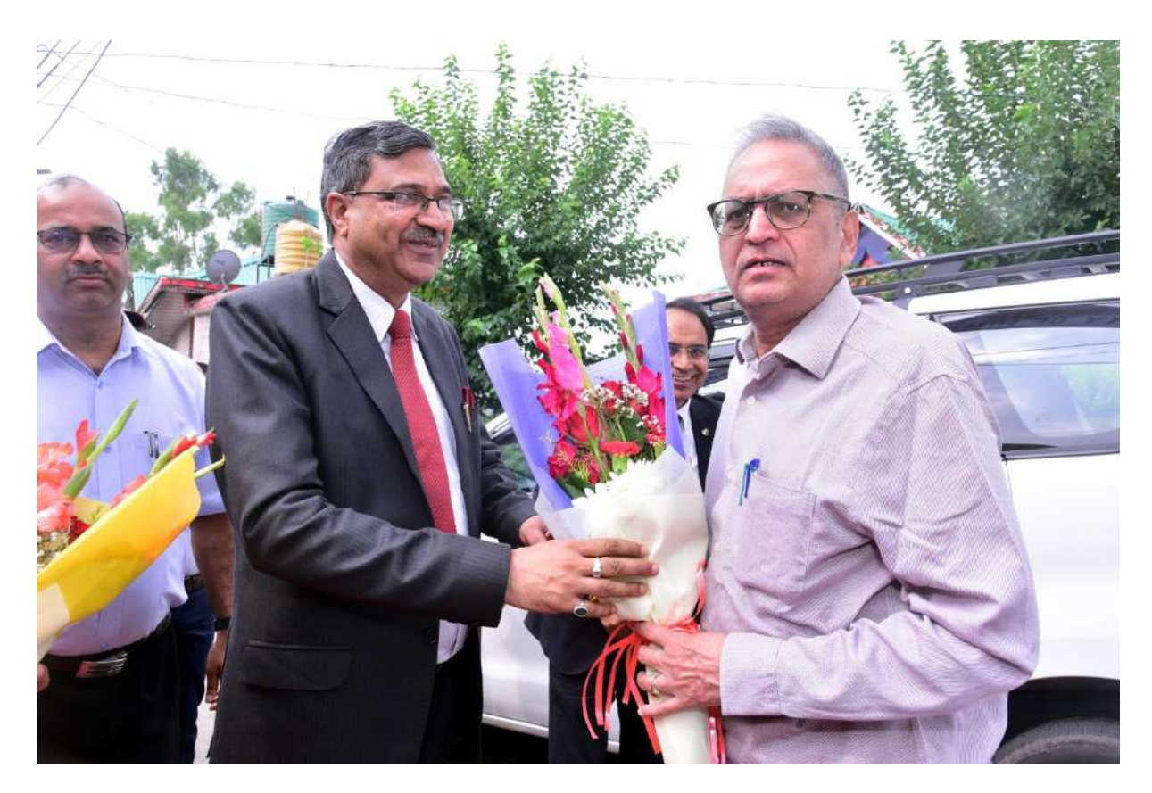
Hon'ble Vice-Chancellor welcomes Chairman NAAC Peer Team

The Central University of Himachal Pradesh (CUHP) holds an A+ grade (2nd Cycle) with 3.42 score from the National Assessment and Accreditation Council (NAAC). It is the first University of state to get this accomplishment. The NAAC peer team's observations stand as a testament to our unwavering commitment to excellence and continuous improvement in higher education. The NAAC team commended our university for its robust academic programs and innovative teaching methodologies. They recognized our faculty members' dedication to fostering an environment conducive to learning and intellectual growth. University has state-of-the-art infrastructure and world-class facilities noted by the NAAC peer team. They further observed the seamless integration of technology in classrooms, well-equipped laboratories, and extensive library resources that enhance the overall learning experience for our students.