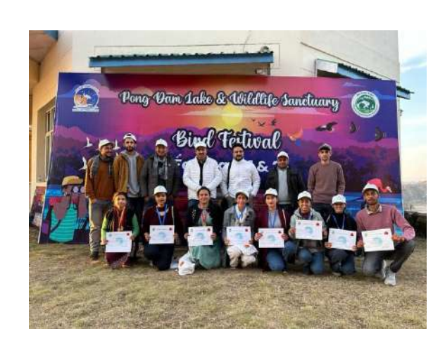
Winner students at Pong Dam Bird Festival