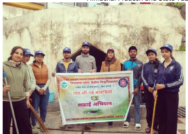
Cleanliness Drive by NSS volunteers of adopted villages

making Panchayat TB Free' by the Department of Social Work and Economics in collaboration with State Task Force, Himachal Pradesh and State Tuberculosis Cell, Himachal Pradesh.