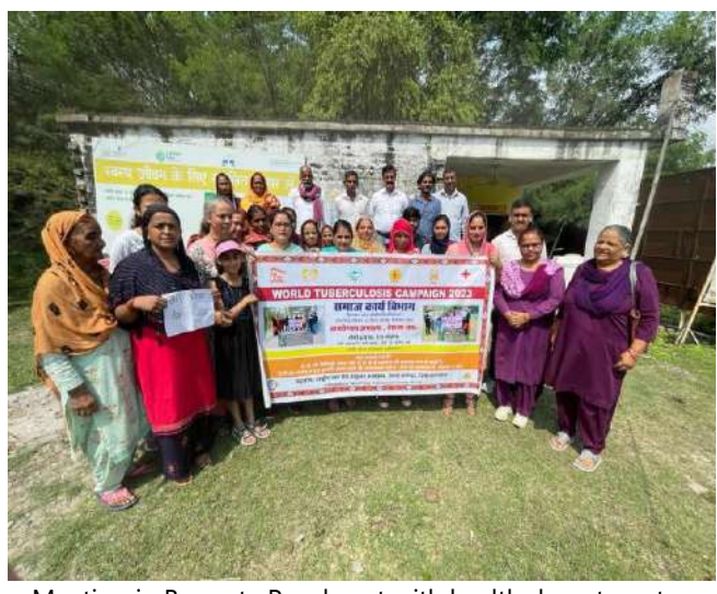
Meeting in Bongata Panchayat with health department officials, elected members of the Panchayat and villagers to make the Panchayat TB free