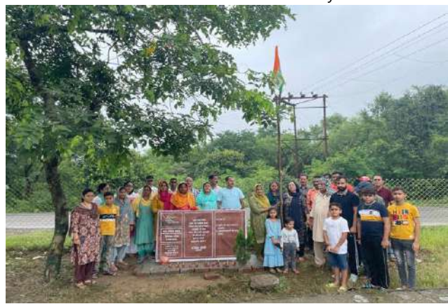
Social Awareness Campaign in a village