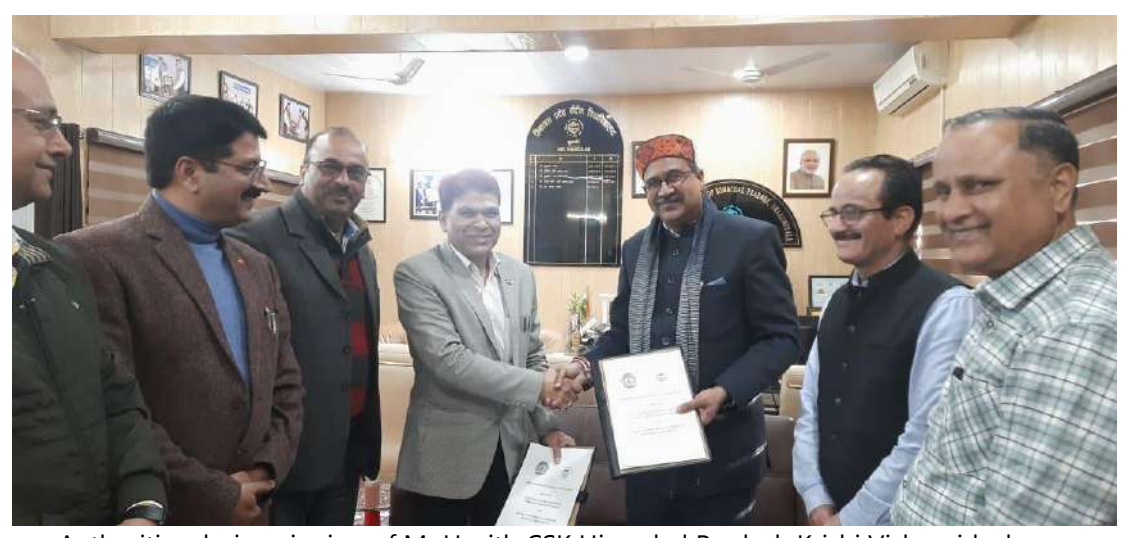
Authorities during signing of MoU with CSK Himachal Pradesh Krishi Vishvavidyalaya, Palampur (HP)