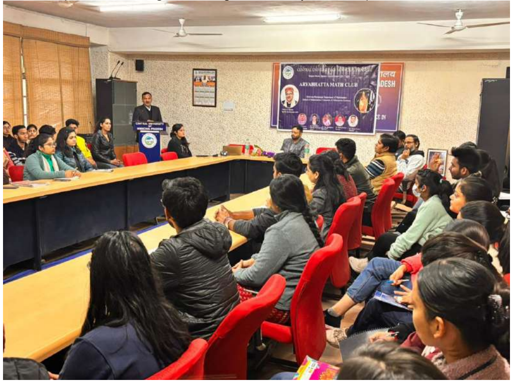
Students participating in Workshop on Stress Management