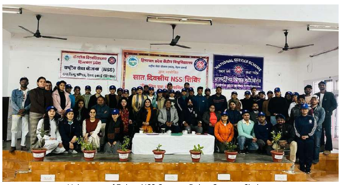
Volunteers of 7 days NSS Camp at Dehra Campus, Shahpur

NSS Special Camps are also organized by the university with an ambition to sensitize the volunteers contributing for the cause of NSS with inculcating the topics ranging from tackling and managing of resources, inducing a much needed sense of Social Responsibility among community members and volunteers, field based learning. All volunteers will learn and empower themselves and thereby make their positive and progressive contributions for the growth of our country.