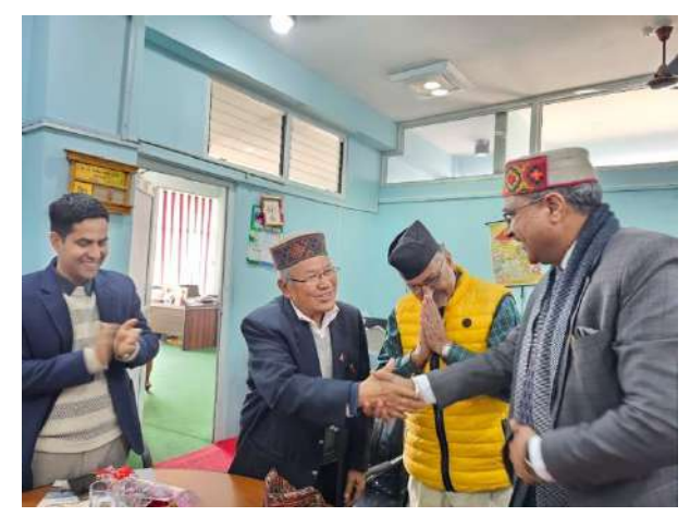
Exchange of greetings b/w the Hon'ble Vice-Chancellor, CUHP & the Hon'ble Vice-Chancellor, Gandaki University, Nepal.