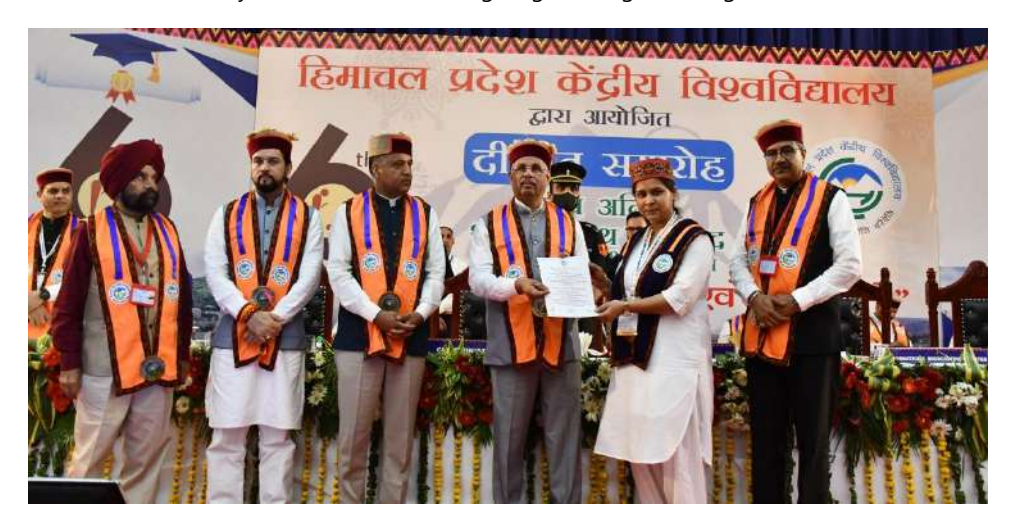
Shri Rajendra Vishwanath Arlekar, the then Hon'ble Governor of HP giving out a degree