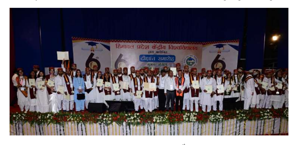
A Group Photo of Degree Recipients during 6^{th} Convocation of CUHP