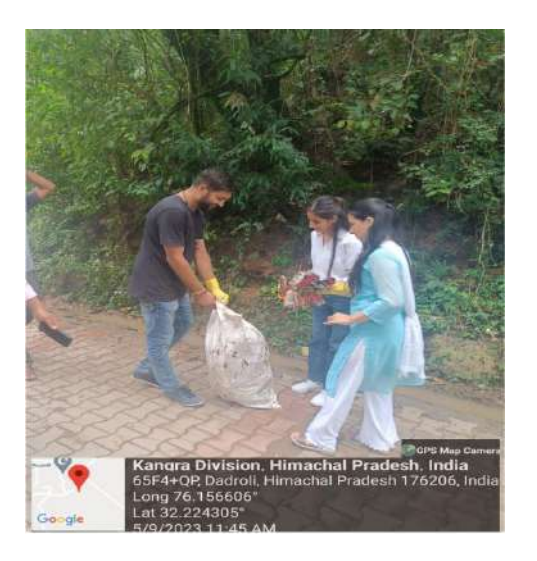
Cleanliness Drive by Department of Mathematics