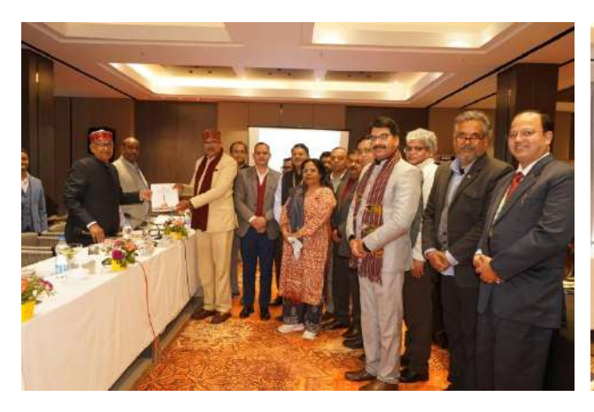
Hon'ble Vice-Chancellor receives a copy of report & assurances from Hon'ble Convener