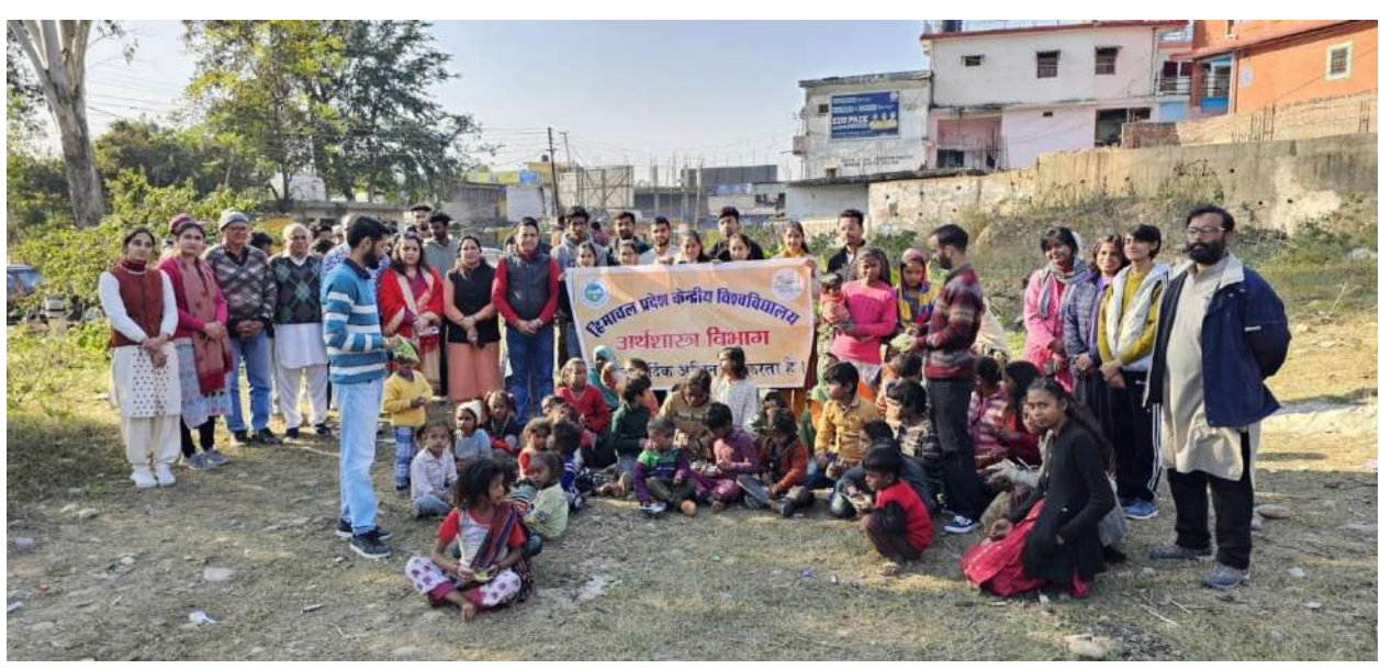
At Villages and Slums - Cleanliness Drive by Department of Social Work & Economics