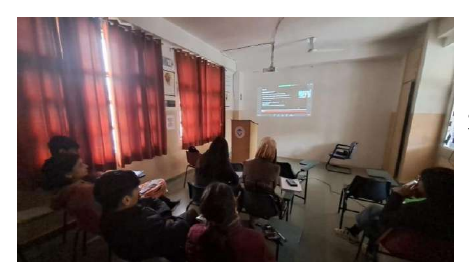
CV Writing Workshop by BBC Hindi (Virtual Mode)