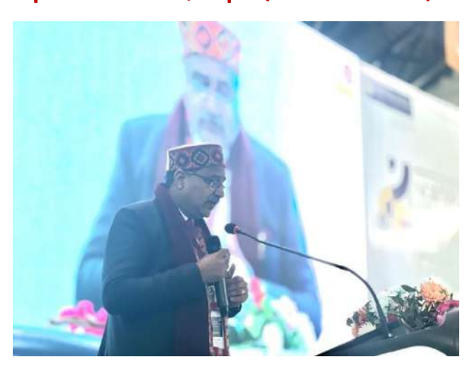
Address by the Hon'ble Vice-Chancellor during a technical session chaired by him during the summit