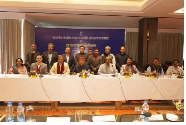
Hon'ble Vice-Chancellor, authorities of the university and officials of the Committee Secretariat with Hon'ble Convener