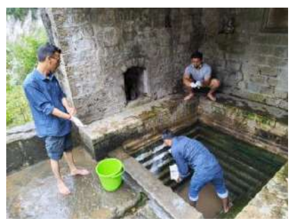
26<sup>th</sup> September, 2023 - On day three on the aegis of Swachhta Pakhwara and Unnat Bharat Abhiyan, the department also organized cleanliness drive at Kotwali Bazar and near Bus Stand. Students also played a Nukkad Naatak under the theme "Swacch Paryavaran – Swacch Parytan" at Kotwali Bazar and Kacchahri Bus Stop where a large number of local people and students were gathered and the message regarding "Swacch Paryavaran – Swacch Parytan" was given by the students.