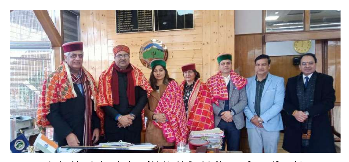
Authorities during signing of MoU with Punjab Bhawan, Surrey (Canada)