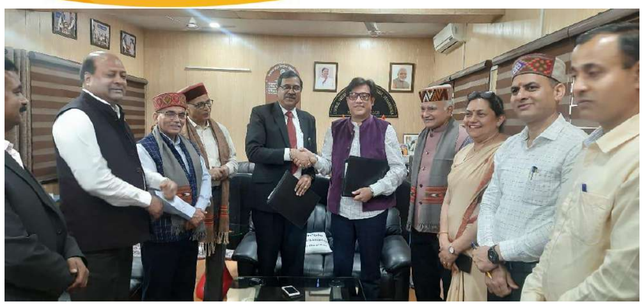
MoU Document Exchange with HVC, Shri Vishwakarma Kaushal Vishwavidyalaya, Gurugram (Haryana)