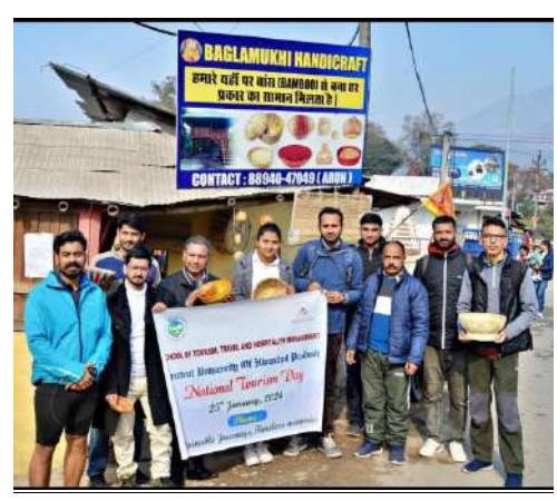
Students of MBA Tourism at Handicraft Market, Fatehpur (HP)