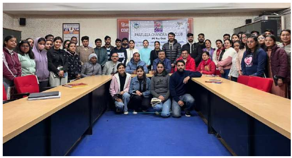
Participants of a seminar organised by PC Ray Club