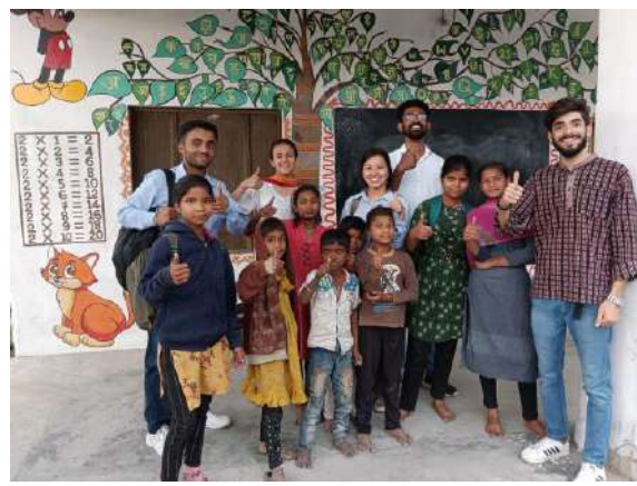
Community Outreach Activity on Health & Hygiene at PAHAL under Unnat Bharat Abhiyan