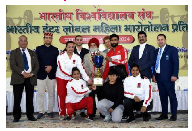
हिमाचल प्रदेश केंद्रीय विश्वविद्यालय धर्मशाल मास्तीय विश्वविद्यालय संघ अखिल भारतीय इंटर जोवल महिला भारोतोलव प्रति