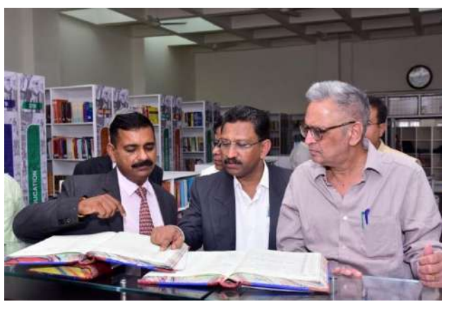
Library inspection by the NAAC Team

Our comprehensive student support services aimed at nurturing the holistic development of our students was equally acknowledged by the team. University offers career counselling and mentoring support along with extracurricular activities and sports facilities to ensure that each of our students receives the necessary support to thrive academically and personally. We offer numerous opportunities for international exposure through exchange programs, collaborative research projects, and study abroad initiatives. These programs broaden the horizons of our students and faculty, fostering cross-cultural understanding and global perspectives.