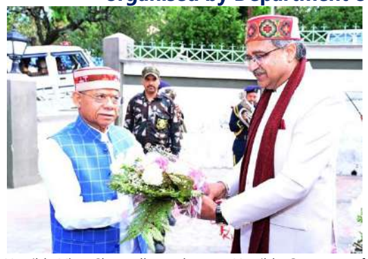
Hon'ble Vice-Chancellor welcomes Hon'ble Governor of Himachal Pradesh Shri Shiv Pratap Shukla

Glimpses of inauguration of ICHR, New Delhi sponsored two-day national seminar organised by Department of History, CUHP (29-30 March 2024)