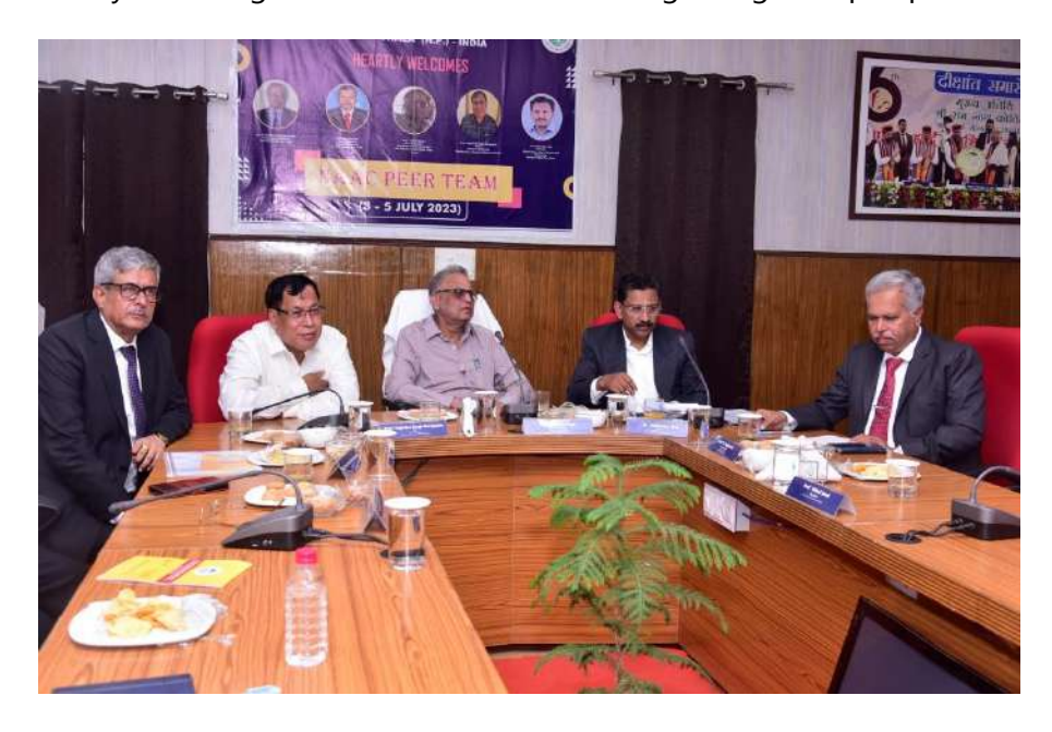
NAAC Peer Team sharing the feedback

Our comprehensive student support services aimed at nurturing the holistic development of our students was equally acknowledged by the team. University offers career counselling and mentoring support along with extracurricular activities and sports facilities to ensure that each of our students receives the necessary support to thrive academically and personally. We offer numerous opportunities for international exposure through exchange programs, collaborative research projects, and study abroad initiatives. These programs broaden the horizons of our students and faculty, fostering cross-cultural understanding and global perspectives.