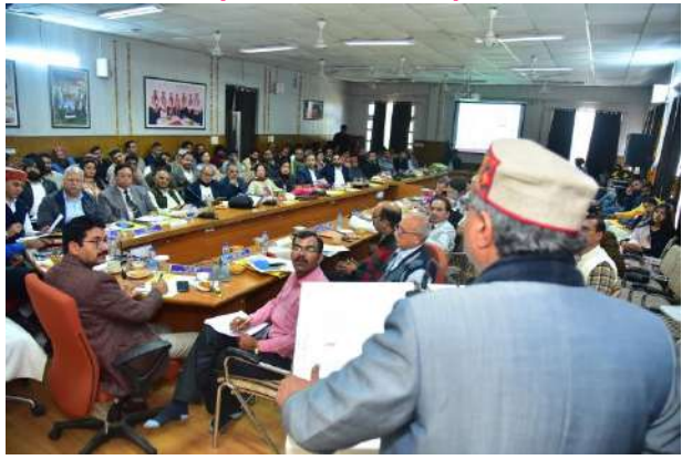
Hon'ble Vice-Chancellor addresses Bharatiya Bhasha Sammelan