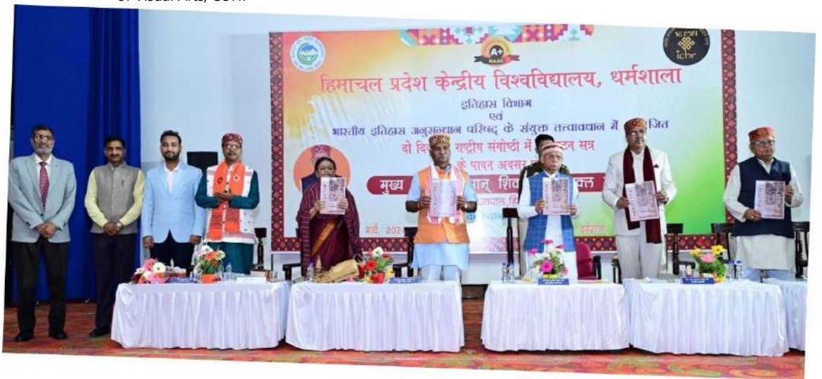
Inauguration of Newsletter of Department of History by the dignataries