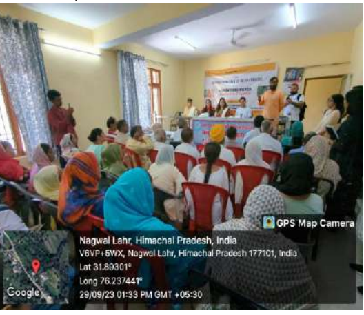
An event on the occasion of International Day of Older Persons in collaboration with Help Age India