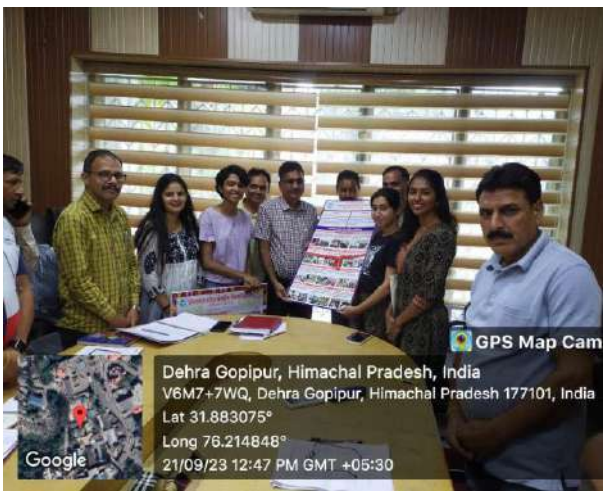
Awareness Program on HIV AIDS at Snot Village