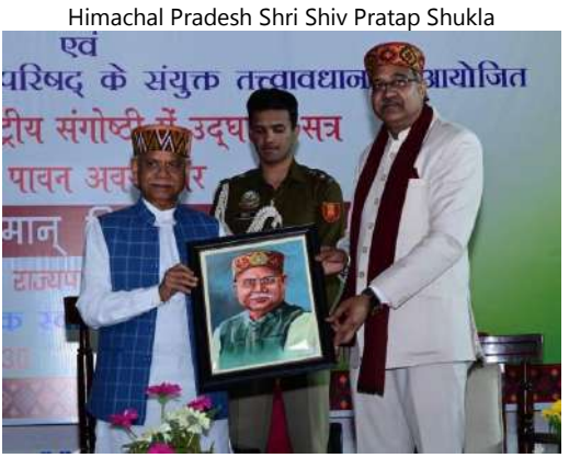
Hon'ble Vice-Chancellor presents potrait of Hon'ble Governor of Himachal Pradesh made by Department of Visual Arts, CUHP