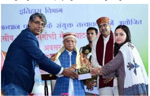
Delegates of Odisha under students' exchange program present shawl & miniature replica of Konark chakra to Hon'ble Governor