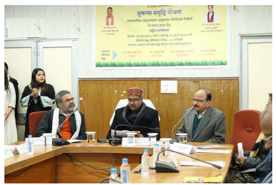
Workshop on Sukanya Samridhi Yojna