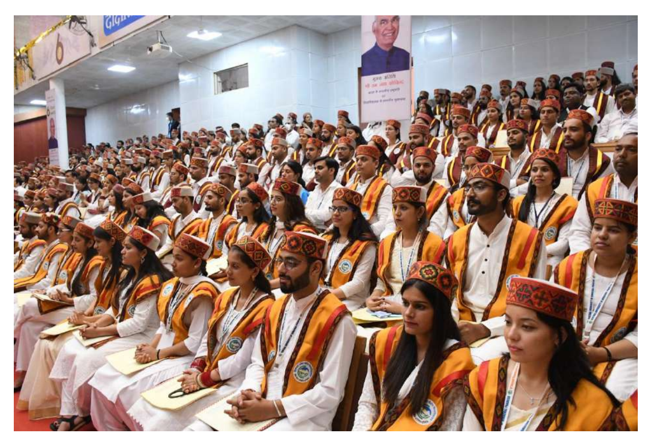
Degree Recipients of CUHP during 6^{\text{th}} Convocation of CUHP