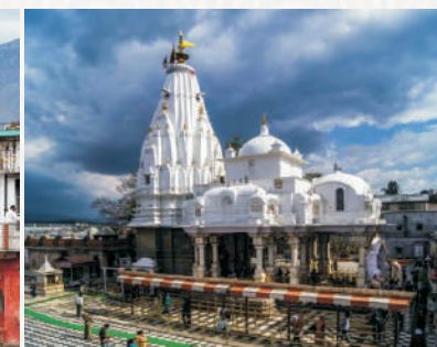
MATA BRIJESHWARI TEMPLE