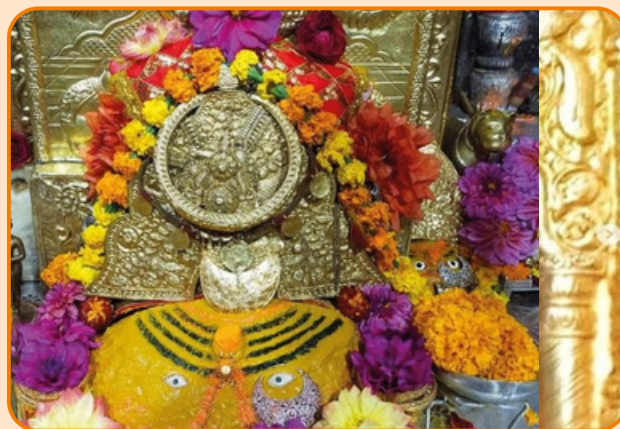
● MAA BAJESHWARI DEVI MANDIR, KANGRA