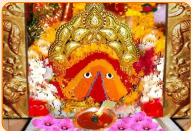
● MAA CHINTPURNI MANDIR, CHINTPURNI