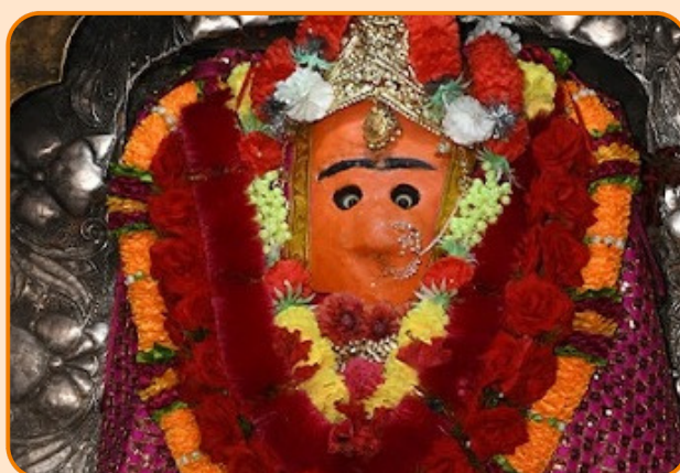
● MAA CHAMUNDA DEVI MANDIR CHAMUNDA