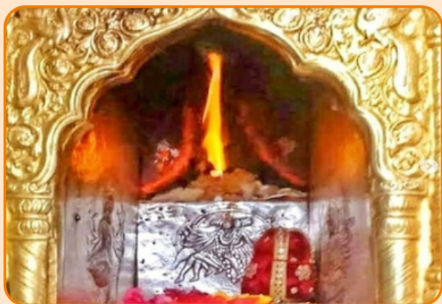
● MAA JAWALA JI MANDIR, JAWALAJI