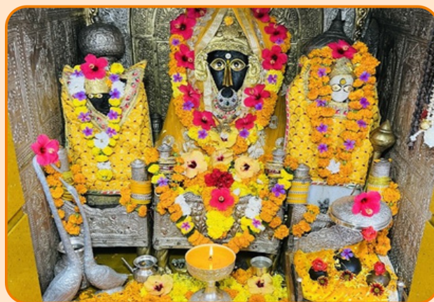
● MAA BAGLAMUKHI MANDIR, BANKHNDI