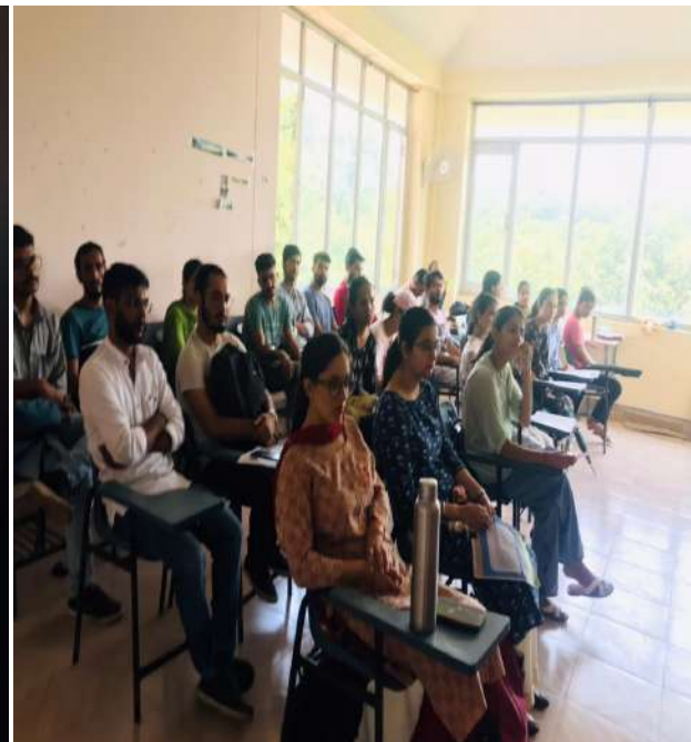
Formation of Student Clubs for NMBA Activities