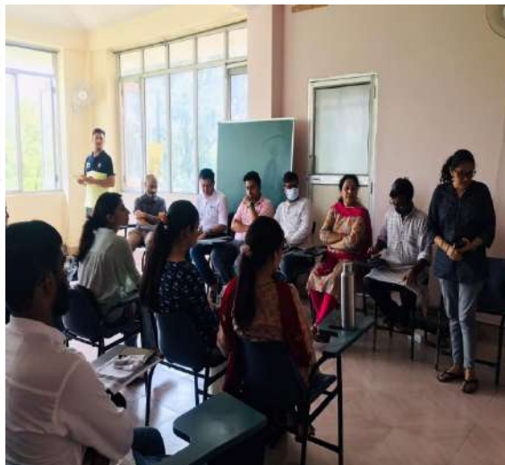
Meeting of Nasha Mukh Bharat Abhiyaan