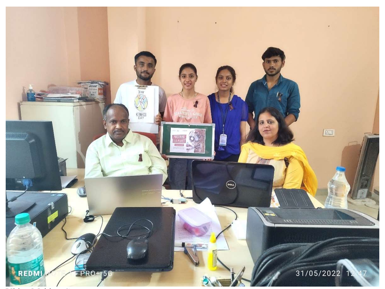
Video Making Contest.