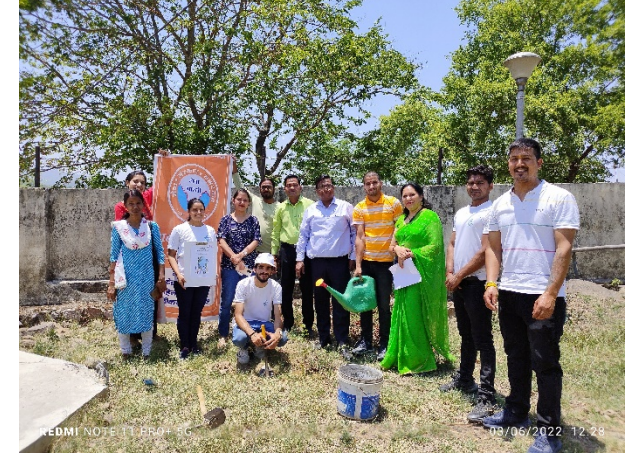
to engage the school students.

Plantation drive at the Office of the fisheries officer on dated 03-06-22