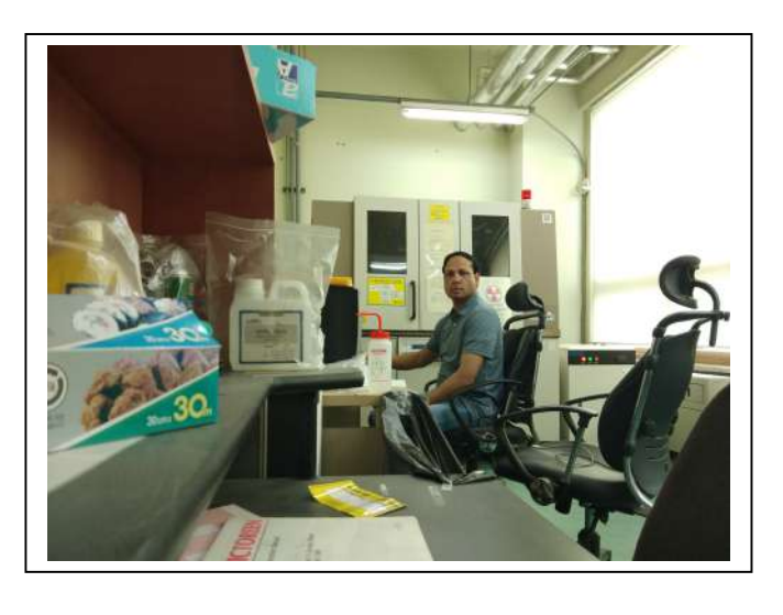
Working on XRD