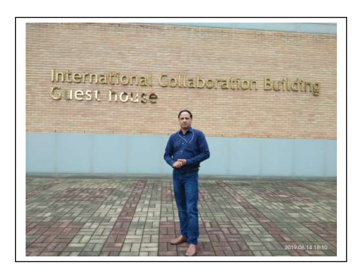
Collaborative Research Visit