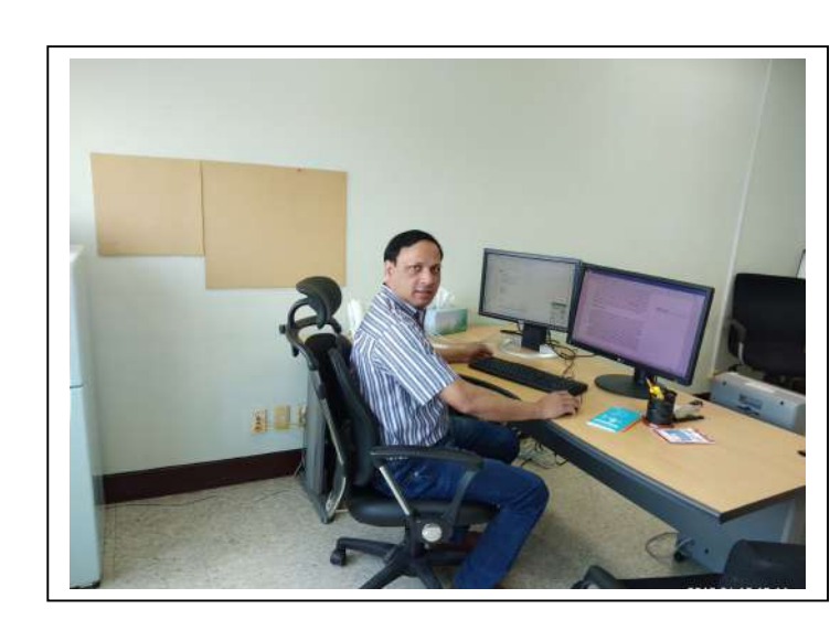
International Collaborative Research with Kyushu University, Japan