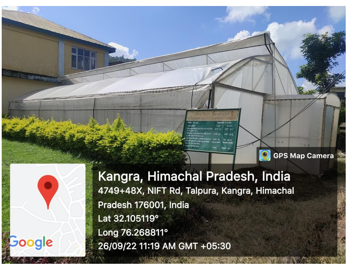
Greenhouse in Krishi Vigyan Kendra, Kangra