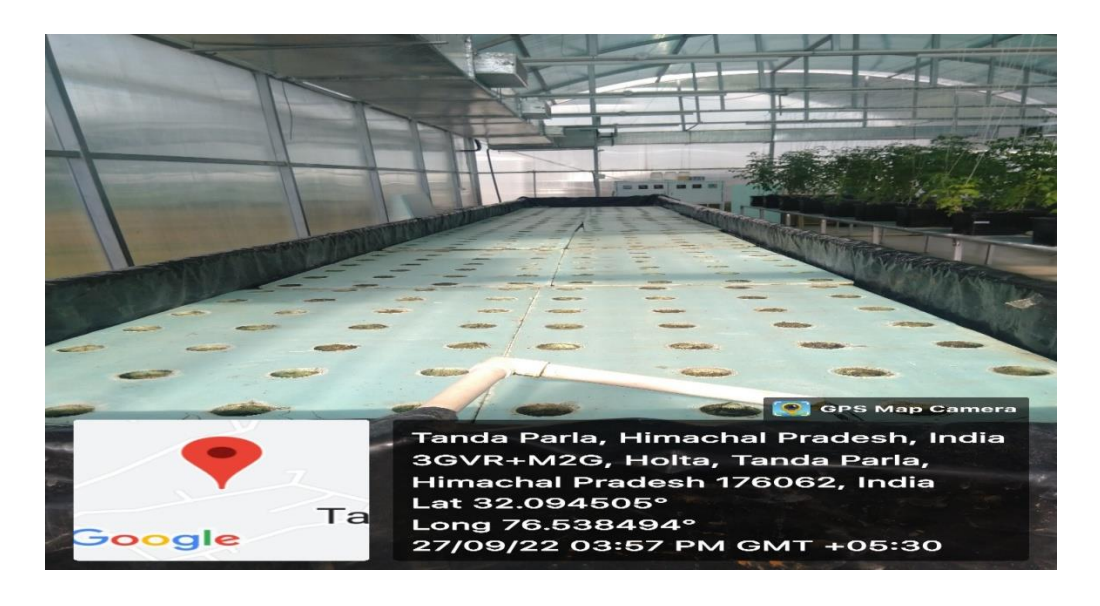
Hydroponic System (DFT)