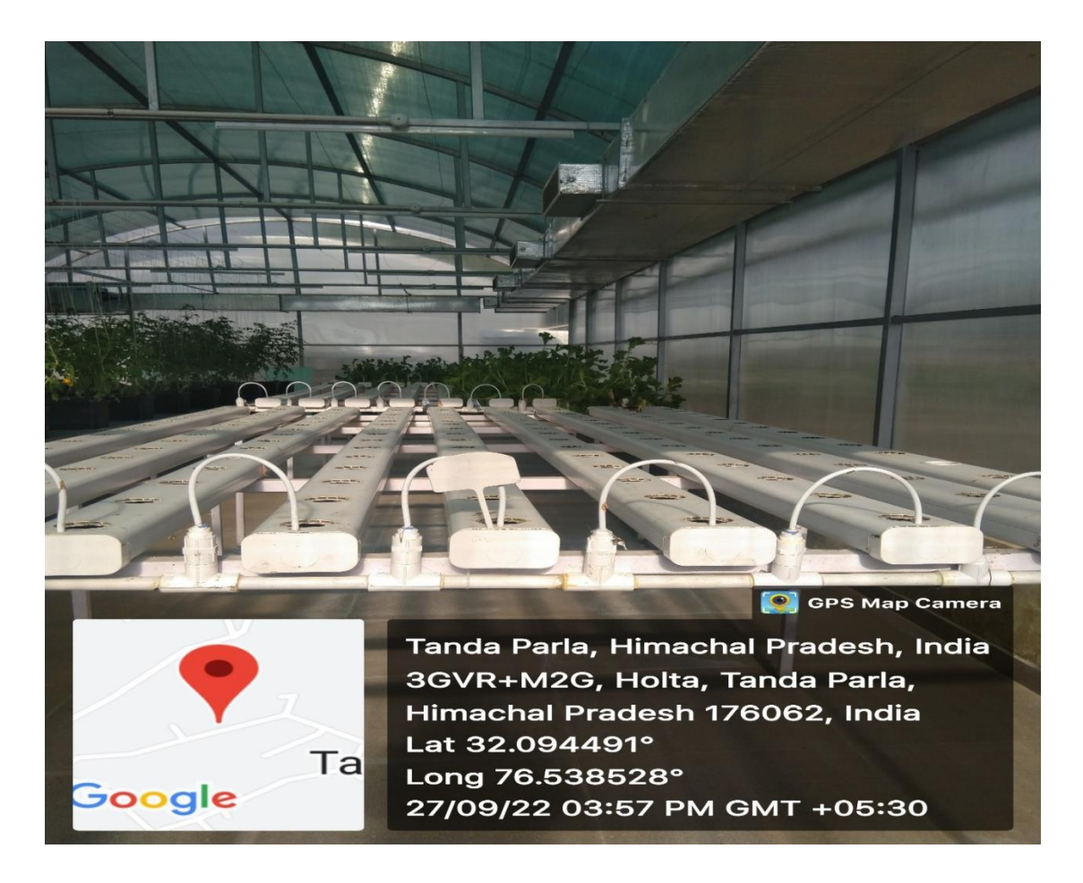
Hydroponic System (NFT)