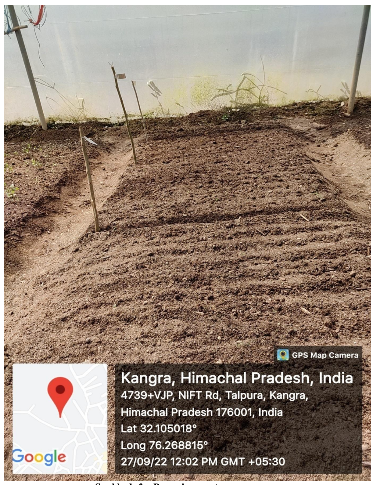
Seed beds for Brussels sprout