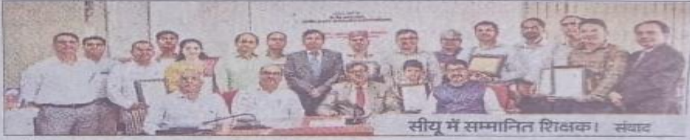
सीयू में सम्मानित शिक्षक।