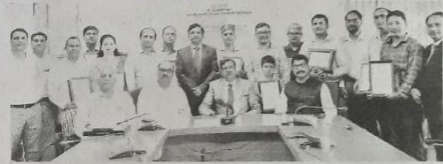
कुलपति ने शुरू की ओईआर सेवा