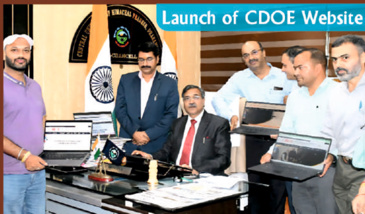
Launch of CDOE Website