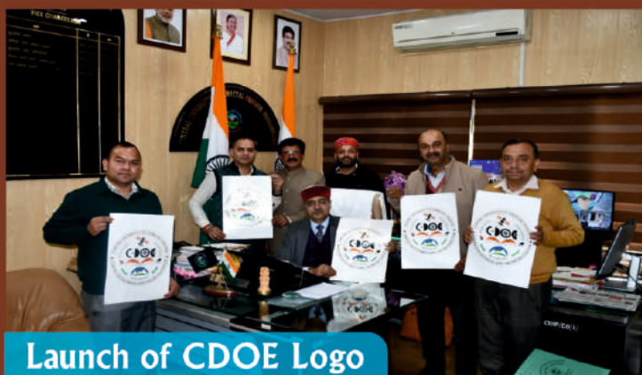
Launch of CDOE Logo